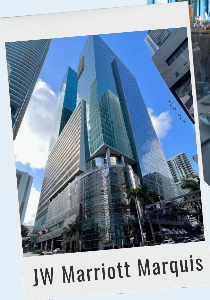
JW Marriott Marquis